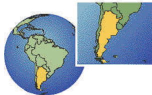
Argentina South America